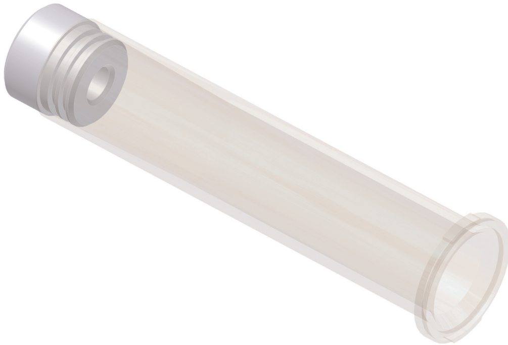
Fig. A2-4. Three-dimensional rendering of SPEXMan reaction vessel with friction stopper designed to accommodate a check valve (Table 1F and G).