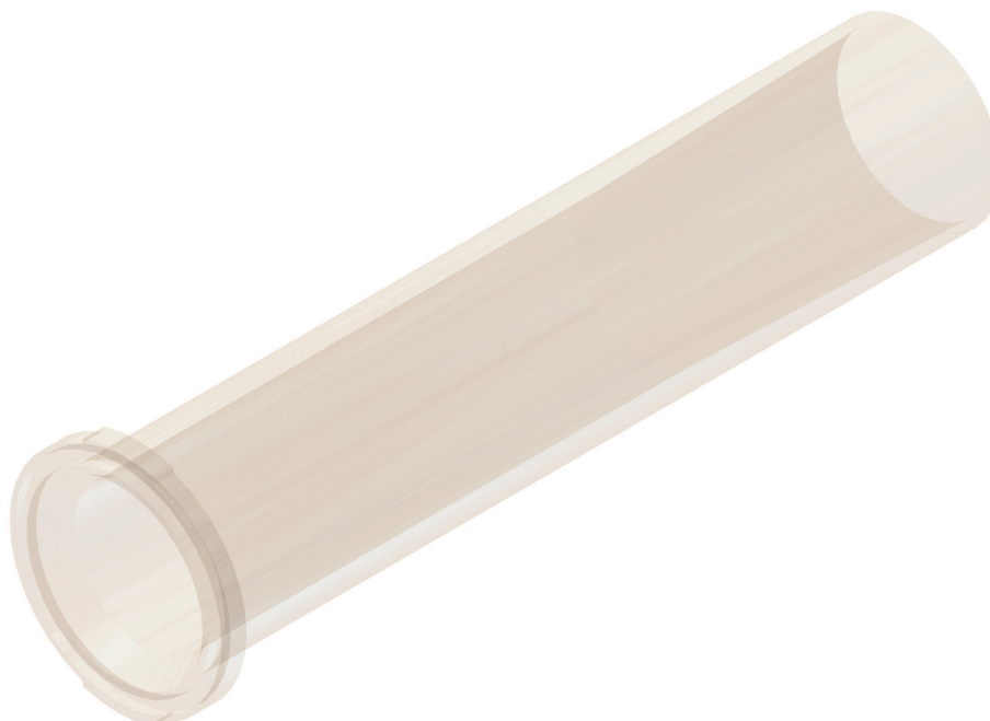
Fig. A2-3. Three-dimensional rendering of SPEXMan reaction vessel showing flanged, notched base of reaction vessel that sits on filter holder.