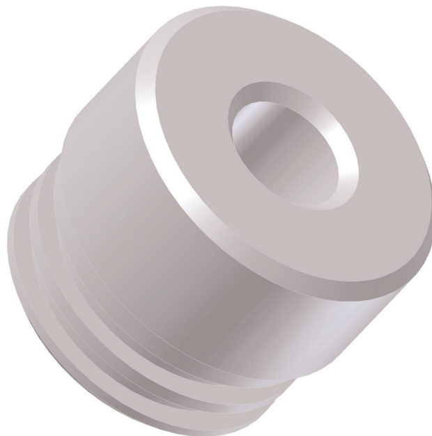
Fig. A2-5. Three-dimensional rendering of friction stopper designed to accommodate a check valve (Table 1F and G).